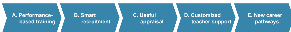
Figure 2: Talent Pipeline