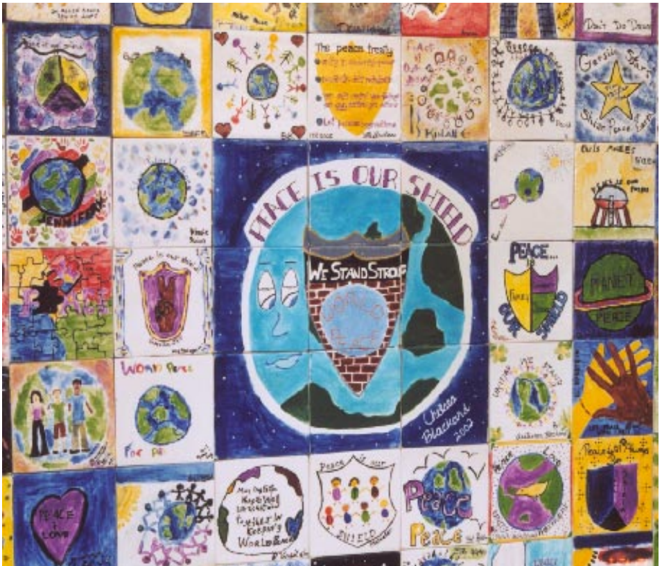
"Peace is our Shield" was the award-winning theme for the 2001-02 Imprint Wall at Garside JHS.

The Garside JHS Imprint Wall proves that powerful results can come when a school and its community work together to prevent violence and promote peace.