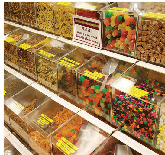
Chart the number or fraction of each color of candies or similar item in different or same size bags and compare the results.

To learn more about the Common Core State Standards for Mathematics, refer to www.corestandards.org/the-standards .