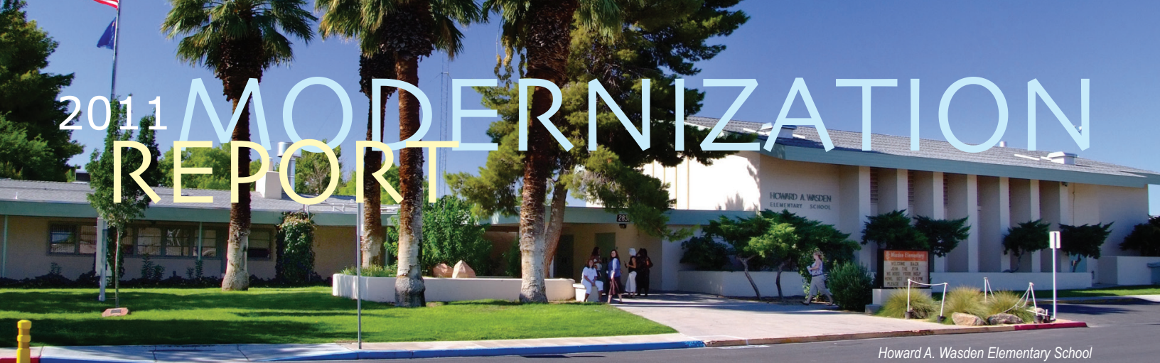
Howard A. Wasden Elementary School