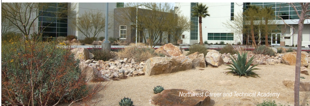
Northwest Career and Technical Academy

The Clark County School District's commitment to build state-of-the-art facilities supports its mission to provide high quality education to our community's most vital investments – our students.