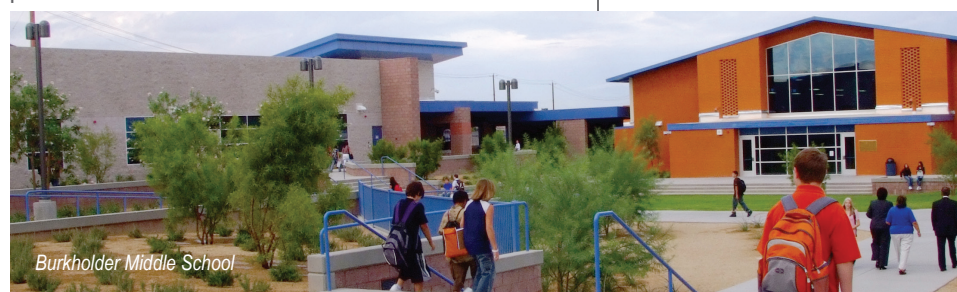
Burkholder Middle School

Other measures resulting in significant savings include packaging of multiple projects for bidding, peer reviews, an eye toward energy-efficient designs, multiple reviews of change orders and carefully monitored inspection practices. Moreover, value engineering, the process of reviewing the design of the building before it is advertised for bids, also helps save precious school construction dollars and incorporates lessons learned.