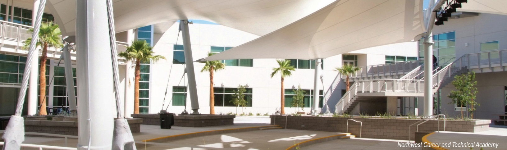
Northwest Career and Technical Academy

The schools included in the replacement program are: