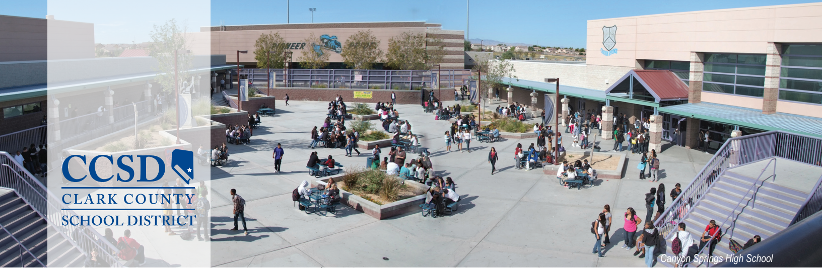
Canyon Springs High School