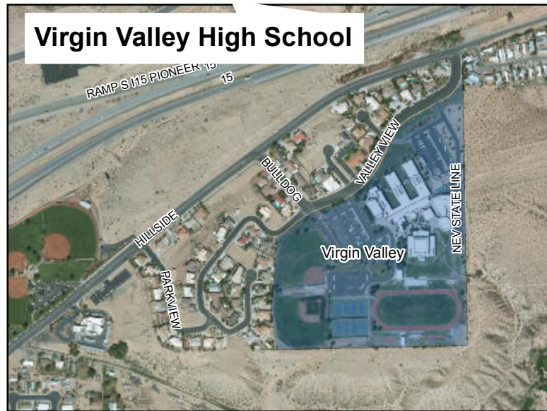
Virgin Valley High School