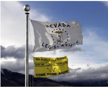
Flags fly over the Nevada State Capitol as the 75 th regular session of the Nevada State Legislature is under way,

There are several ways to get involved and make your voice heard.