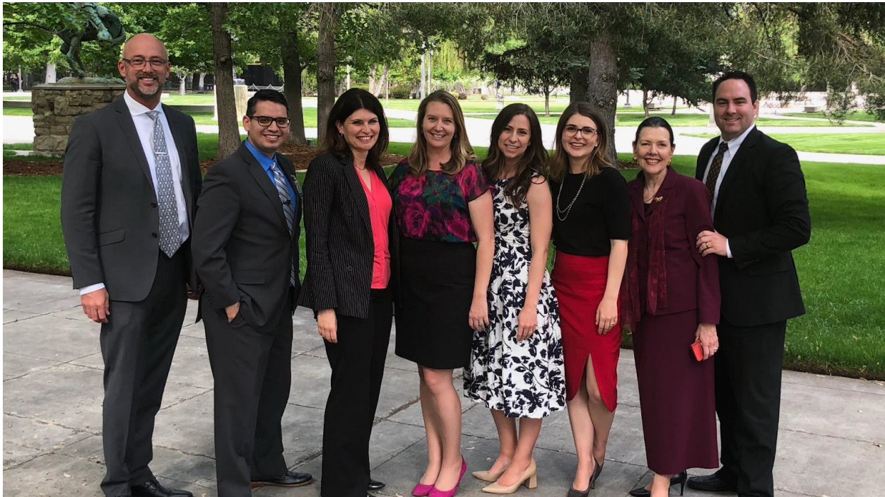
CCSD Government Relations

Finally a big thank you not only to our full CCSD Government Relations team, but also to our fellow education advocates who represented all of Nevada's school districts, school boards, and superintendents. You can see a picture of our team and other education activists below. WE appreciate their hard work on behalf of all the students in the great state of Nevada. Thank you!