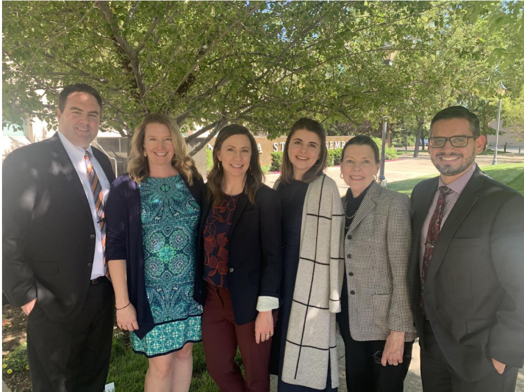
CCSD Government Relations

Thank you to many of our great partners who supported us this past session. Finally a big thank you not only to our full CCSD Government Relations team, but also to our fellow education advocates who represented all of Nevada's school districts, school boards, and superintendents. You can see a picture of our team and other education advocates below. We appreciate their hard work on behalf of all the students in the great state of Nevada. Thank you!